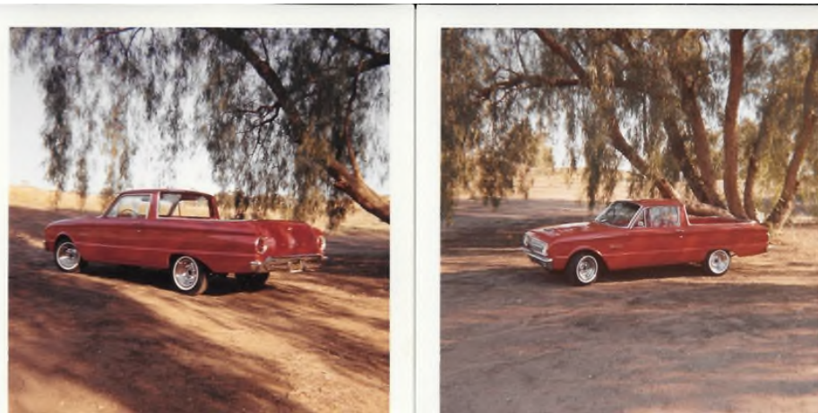
1963 Falcon Ranchero