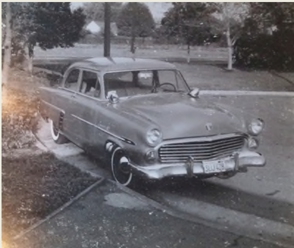
52 Ford Custom line