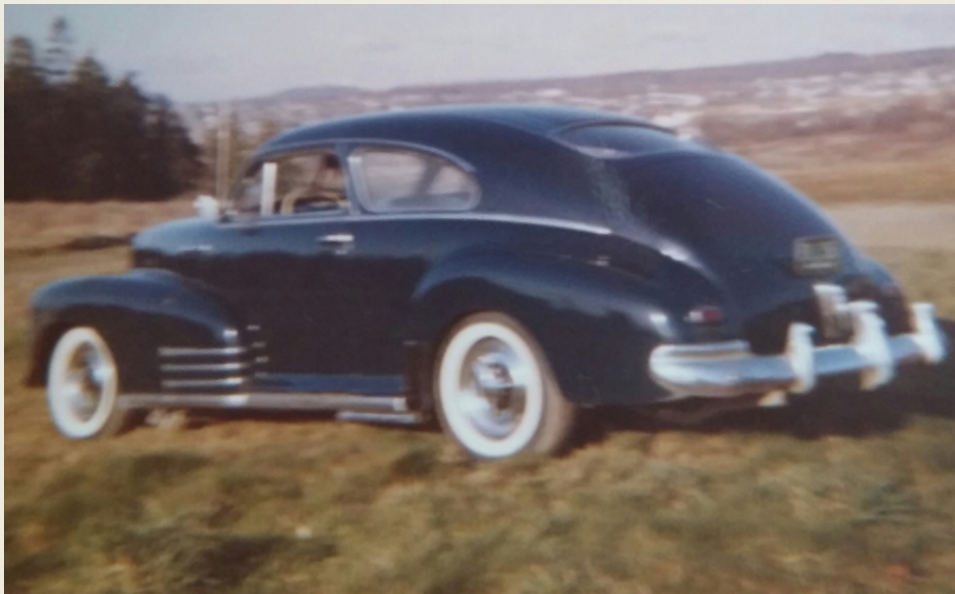
48 Chev Fleetline